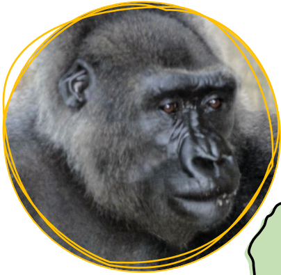
Cross River gorilla, The most endangered and the focus of our project

The next step is to make you an expert on Cross River gorillas. Read through these pages, completing the small activities as you go. Look out for small challenges, and fun facts about where to find Cross River gorillas, how to find them and how to help them.