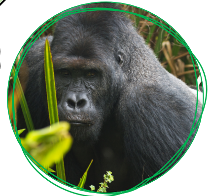
Eastern lowland gorilla, The largest gorilla

Above you can see all four types (subspecies) of gorillas and where they live in Africa. Notice how they all live close to the centre? Cross River gorillas are most like Western lowland gorillas, who they live closest to.