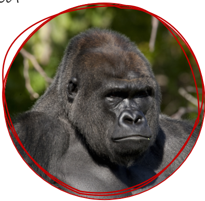
Western lowland gorilla, The type you'll find in zoos