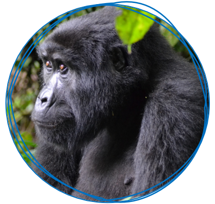
Mountain gorilla, Successfully being saved from extinction